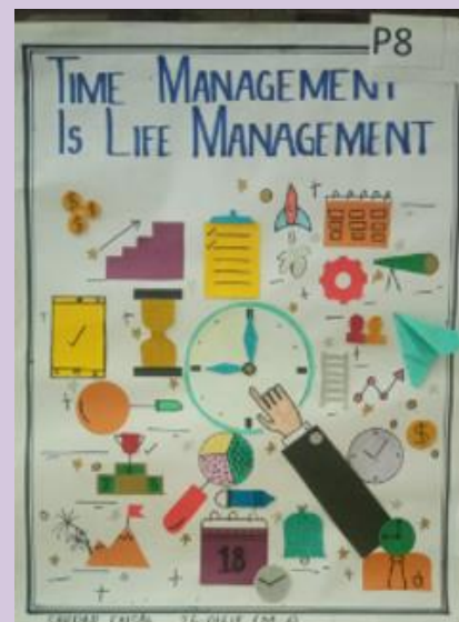
The winning Poster