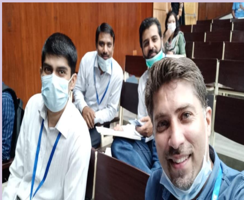
Faculty Retreat, 2021