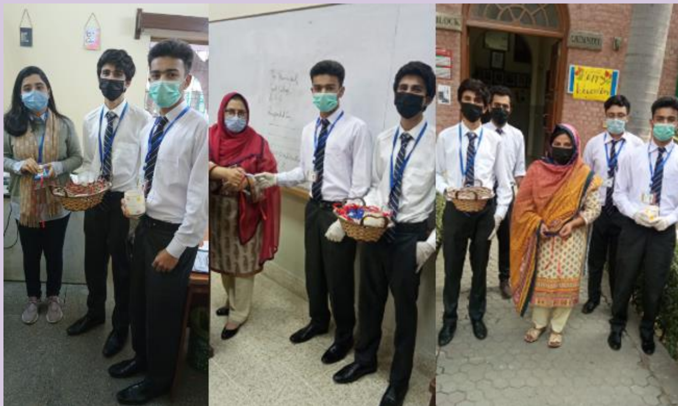
Students presenting cards and souvenirs to female faculty members