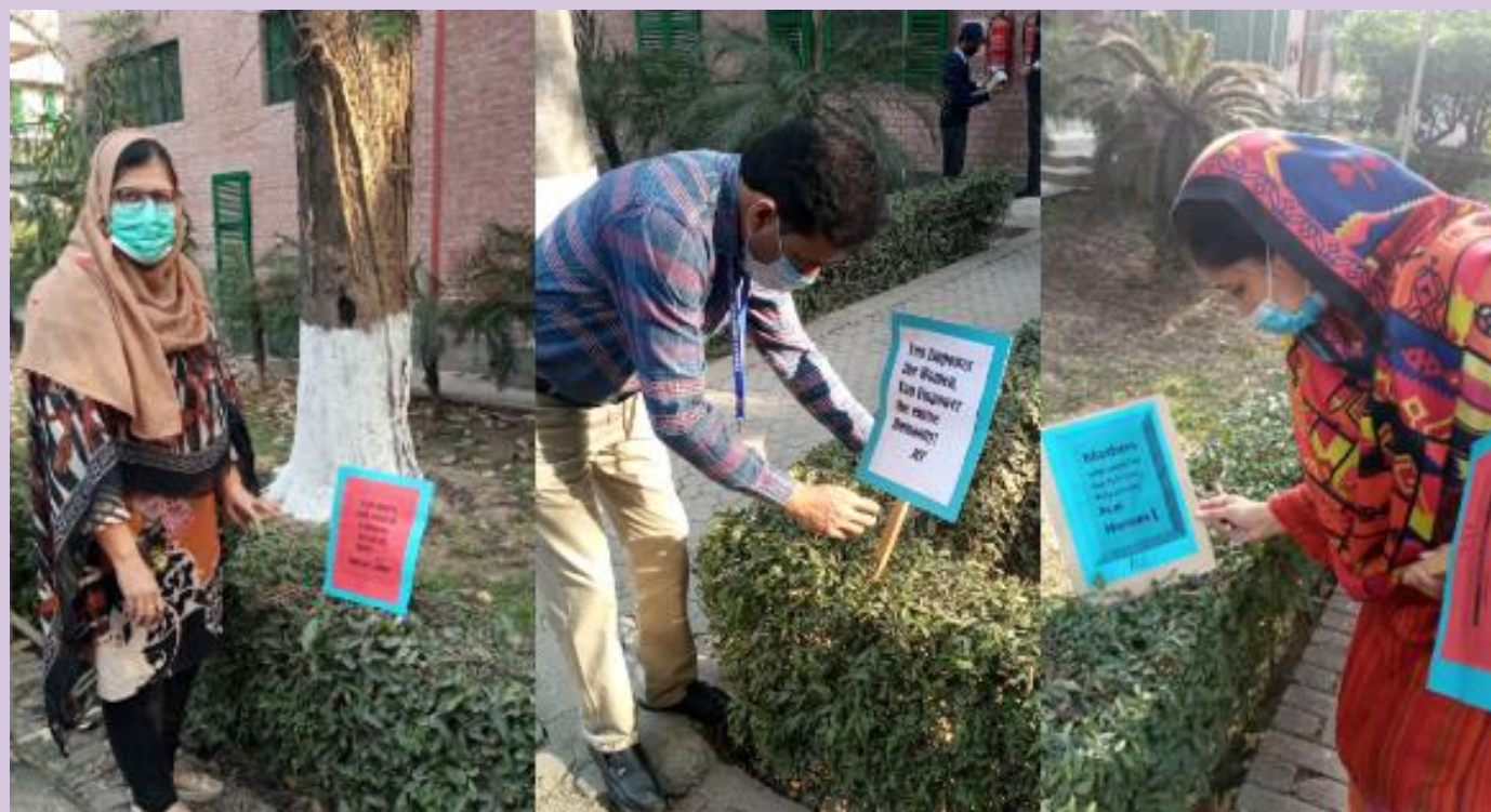
Team ICC mounting different posters