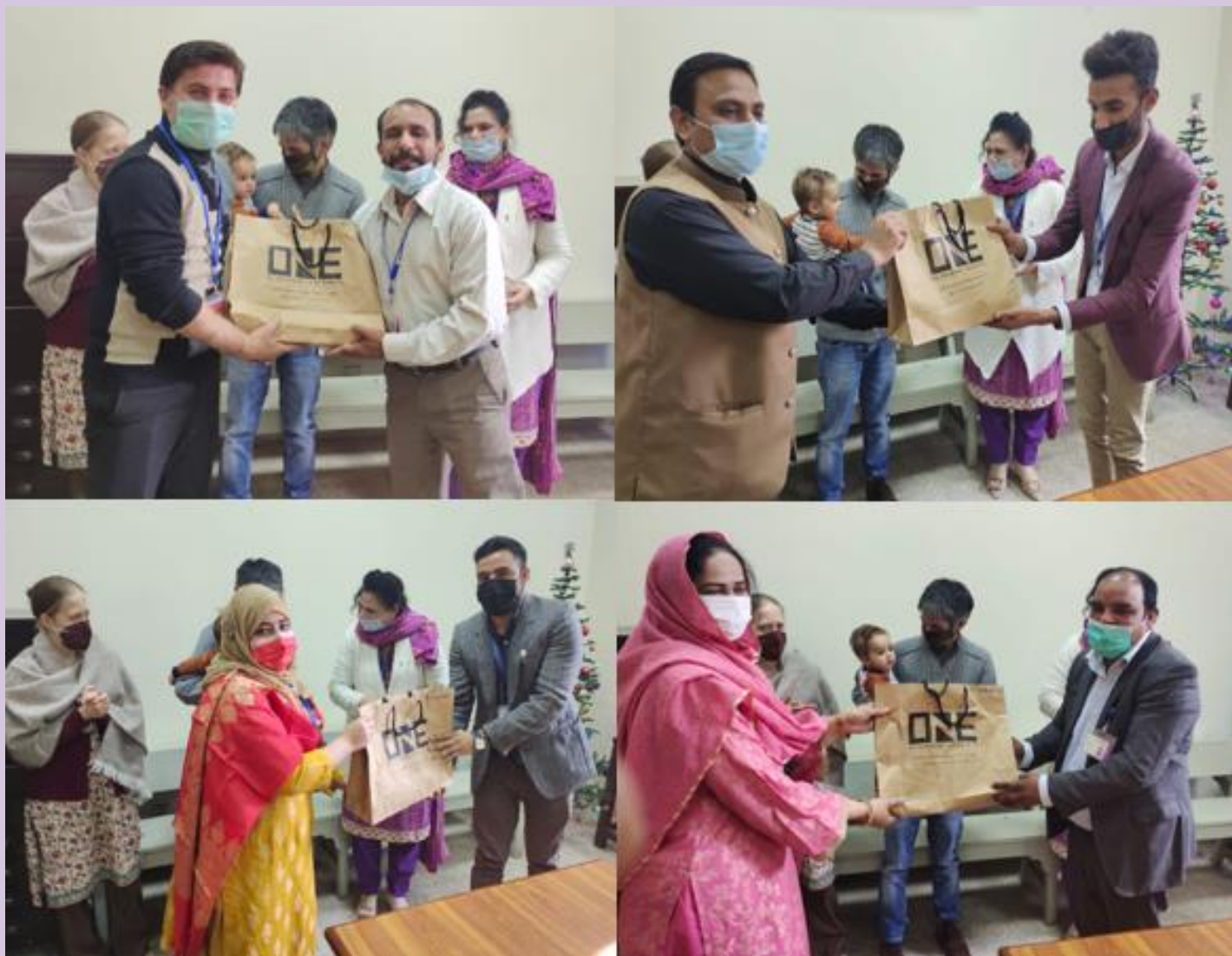
To share happiness and blessings of Christmas, Faculty members distributing gifts among lab staff