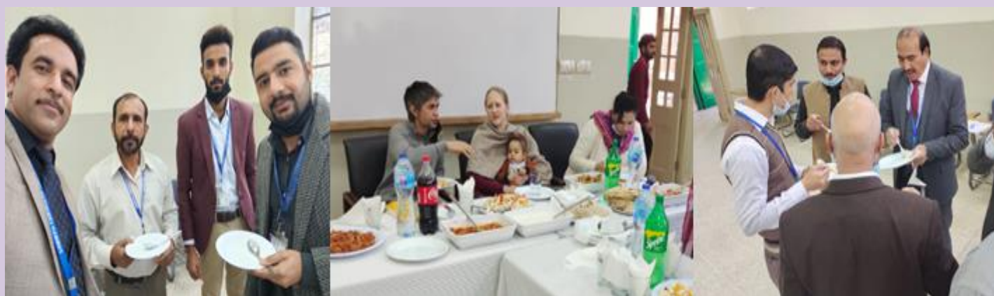
Chief Guest, Faculty and Staff enjoying delicious Lunch.