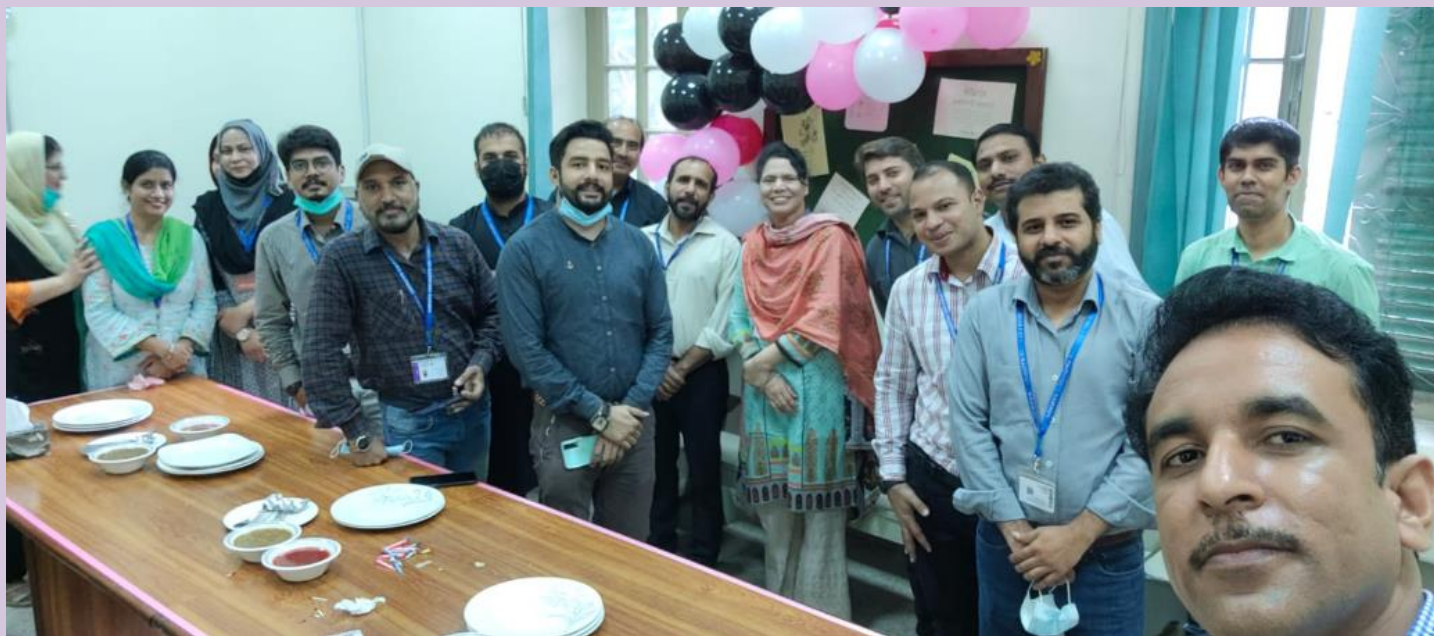
We call it "Selfie of the Year"