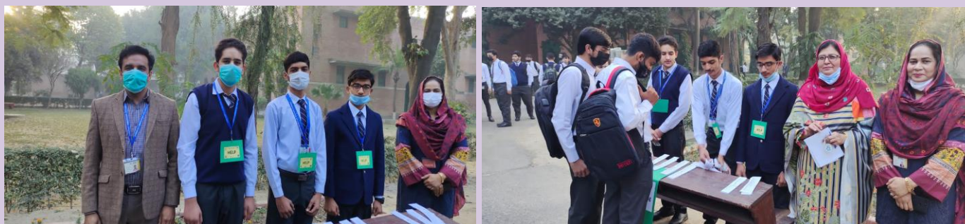
ICC team welcomed freshmen

Intellectual chemistry club welcomed incoming first year students on 22 nd November, 2021. Along with the team ICC and office bearers who very warm heartedly welcomed the freshmen. It is no doubt that students at this stage are so much excited about entering into a new phase of life in college;. Giving them such greetings by the team and the faculty is appreciable.