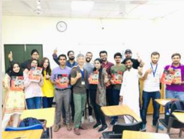
Chinese language students delightfully posing with their instructor