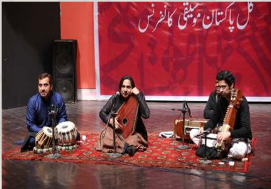
Ustad Shafqat Salamat Ali Khan