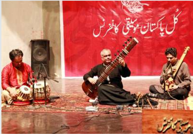
Ustad Ashraf Shareef Khan