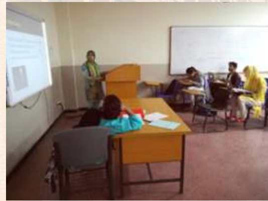
Presentations on “ MOI-MEME ” (Myself) by FREN101students