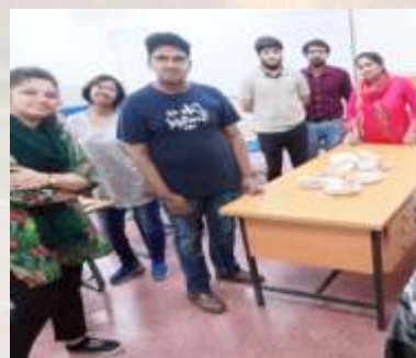
Tasting the French Culture by celebrating a special “ Recipe Day ”