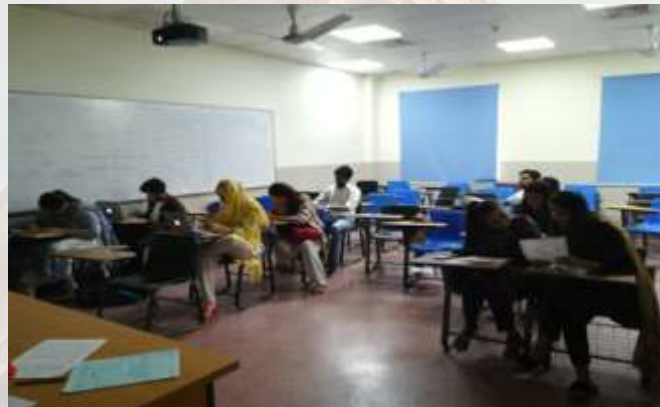
Zealous learners of French