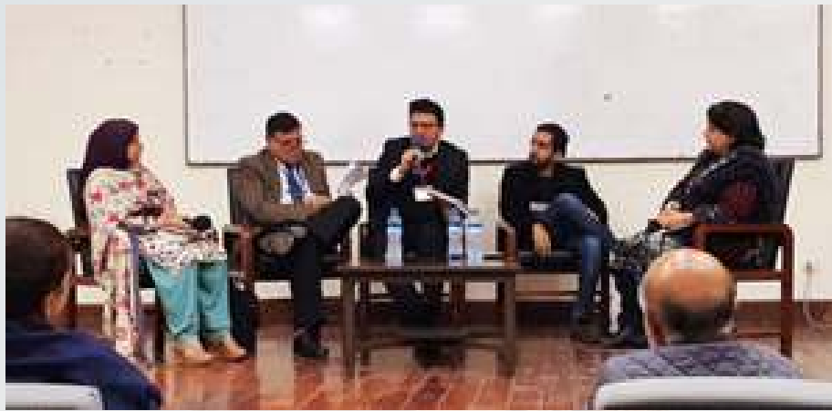
BOOK TALK SASA