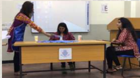
Group Presentation in Chinese Language

Chinese course classes had a group presentation in which they applied everything learnt in class to create a scenario role play. It was done entirely in Chinese language using phrases, sentences, words and grammar learnt in class which showed how confident the students were in speaking in Chinese.