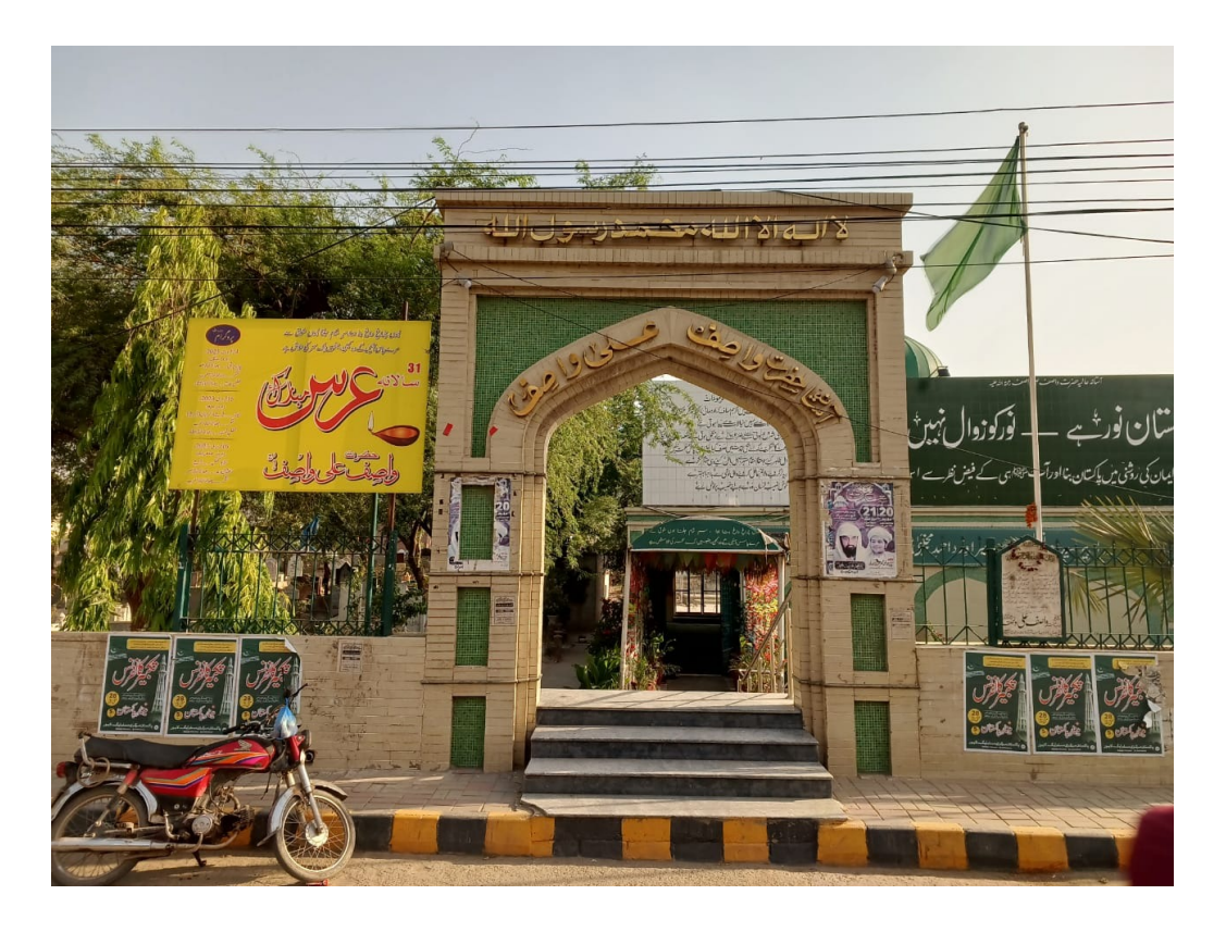
Figure 1 Entrance to the shrine