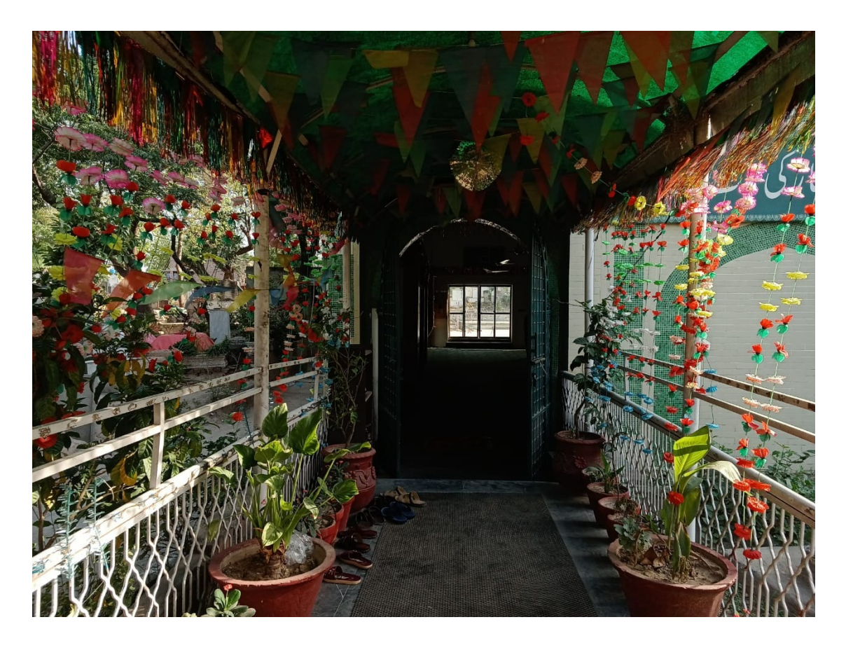
Figure 3 Main door leading into the shrine