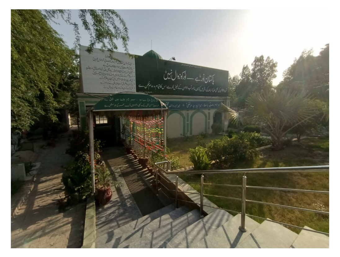
Figure 2 Pathing heading into the shrine