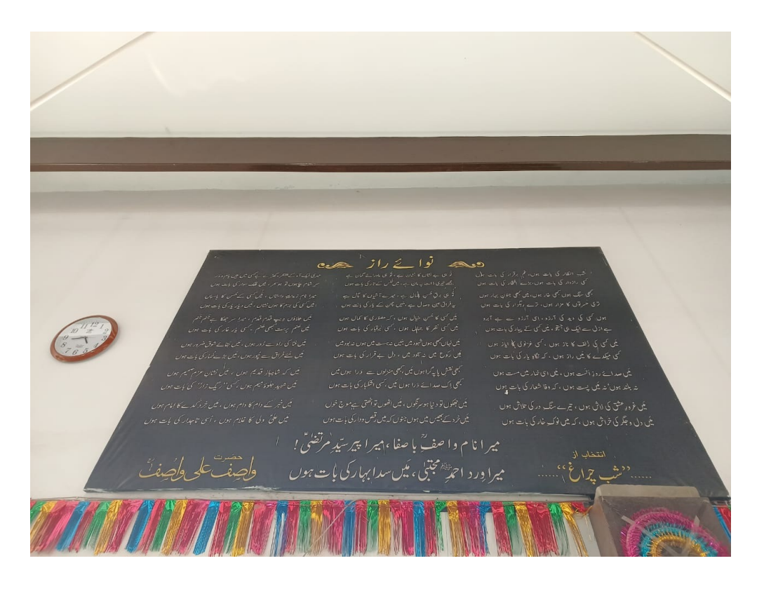
Figure 9 Poetry posted on the wall