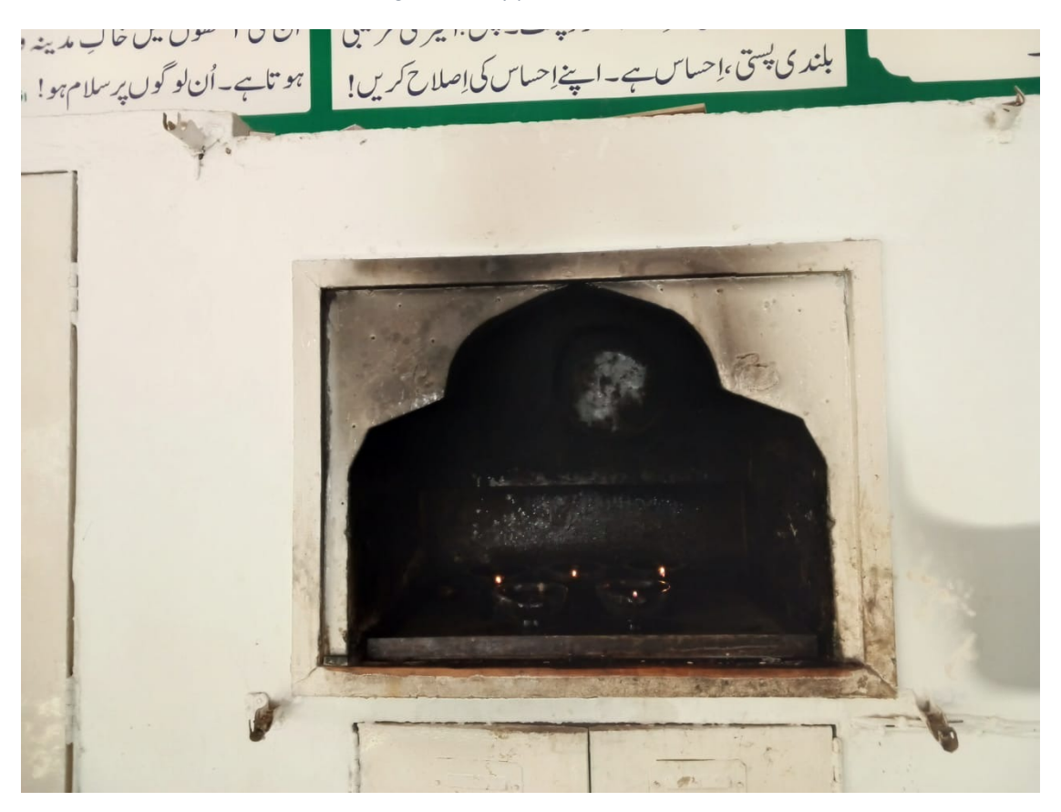
Figure 10 Oil lamp shelf