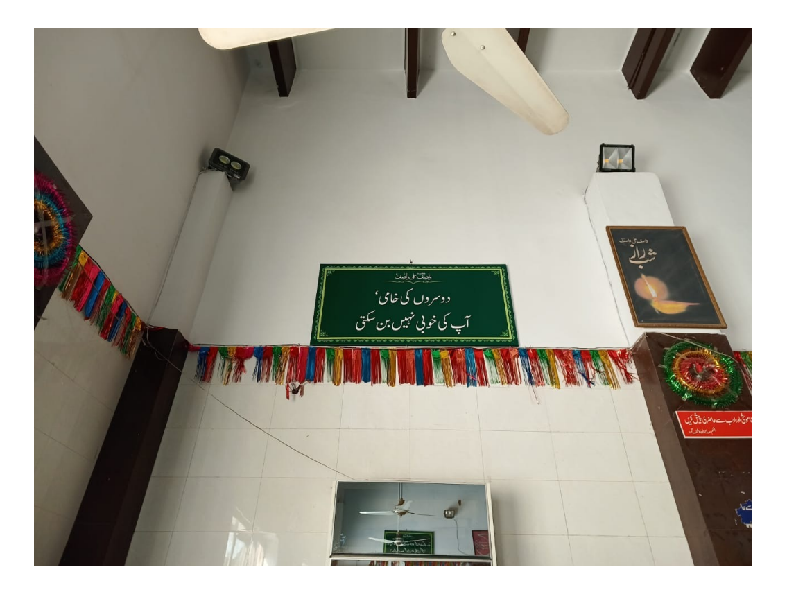
Figure 11 A saying/teaching of Wasif Ali Wasif on a poster