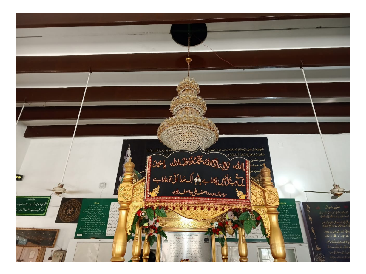
Figure 7 Black Banner with Kalima and Poetry