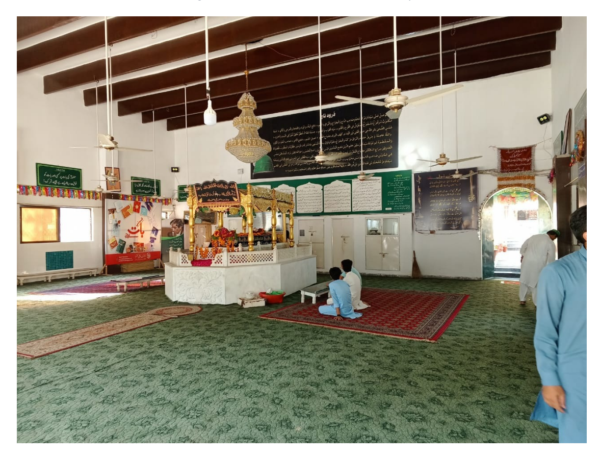
Figure 8 The inside of the shrine