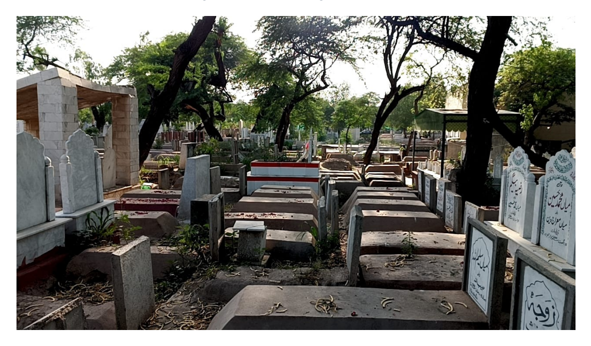
Figure 4 Graves surrounding the shrine