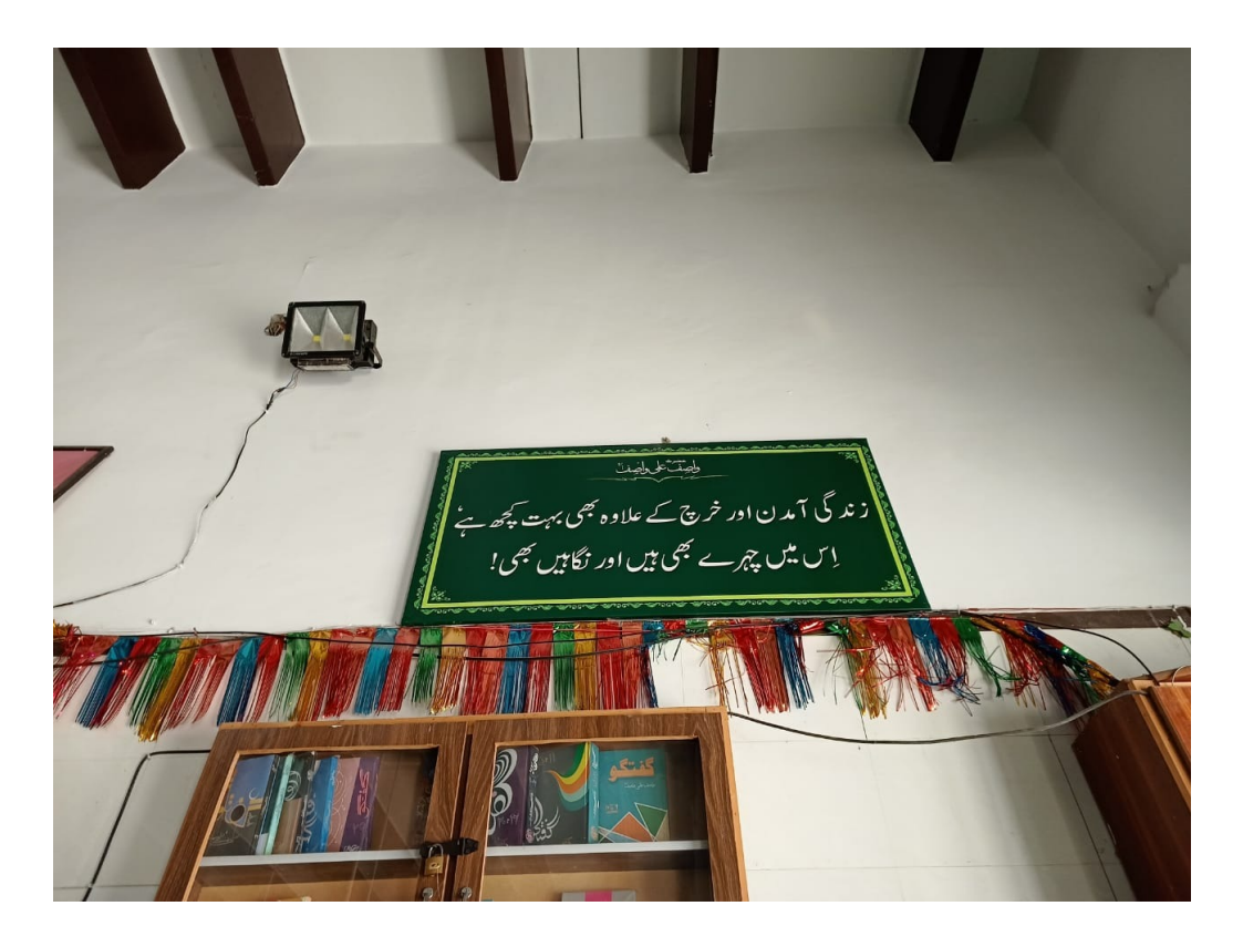
Figure 12 A saying/teaching of Wasif Ali Wasif on a poster