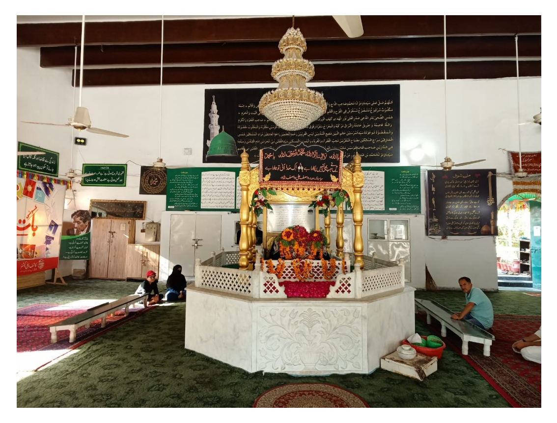
Figure 6 Tomb of Wasif Ali Wasif