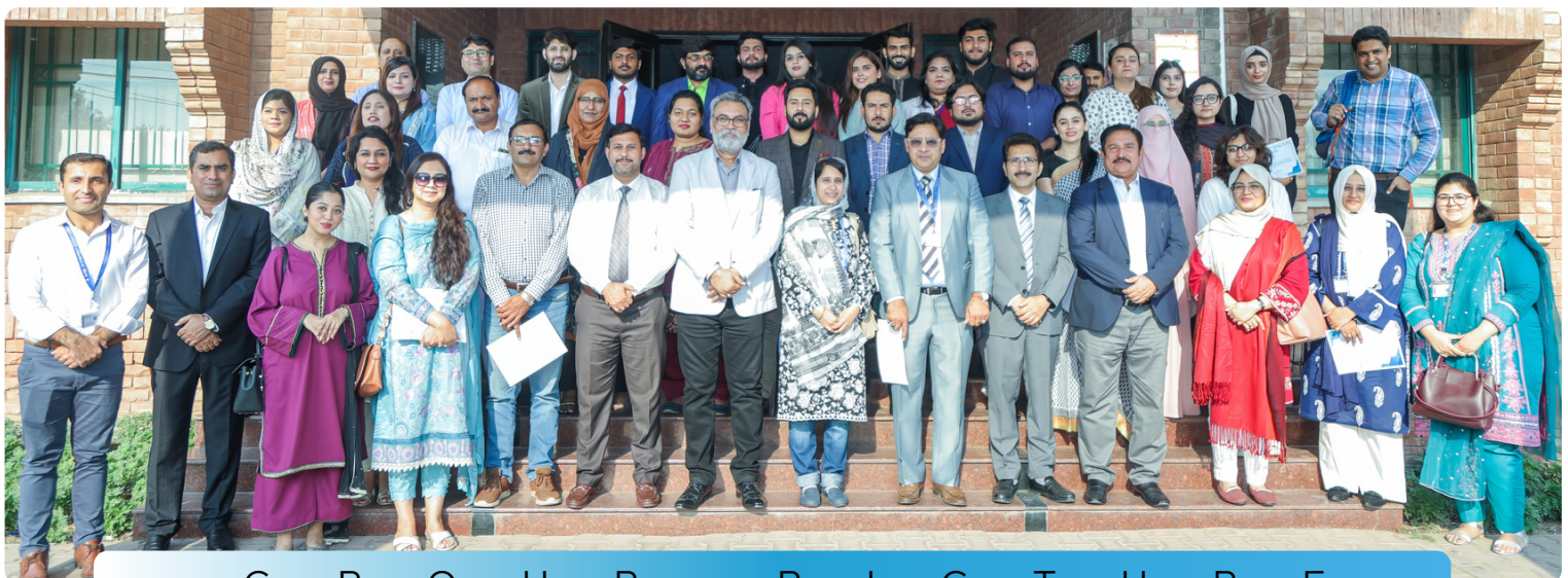
G R O U P P I C T U R E