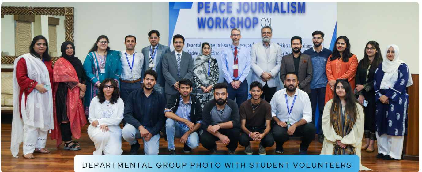
DEPARTMENTAL GROUP PHOTO WITH STUDENT VOLUNTEERS