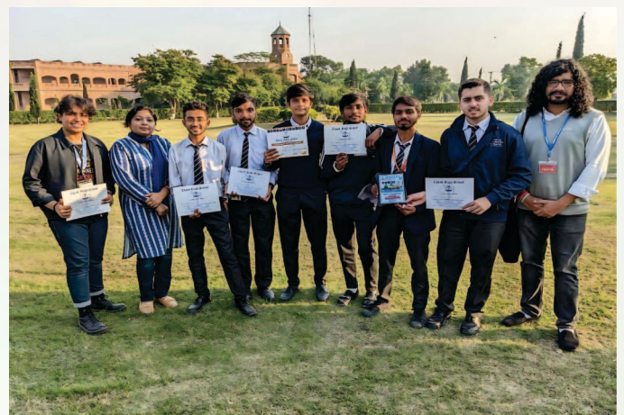
Team FCC Faculty and Students